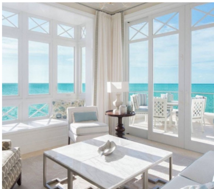
THE SHORE CLUB TURKS & CAICOS