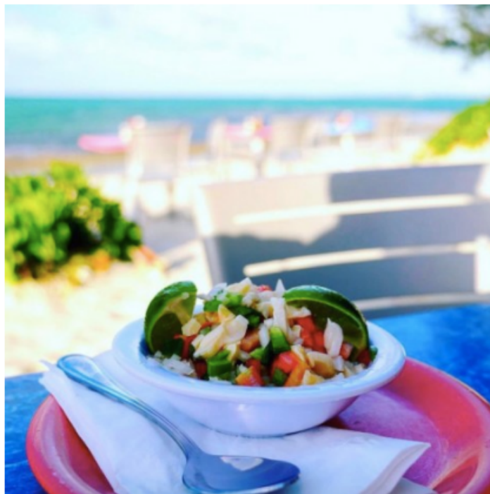
DA CONCH SHAC