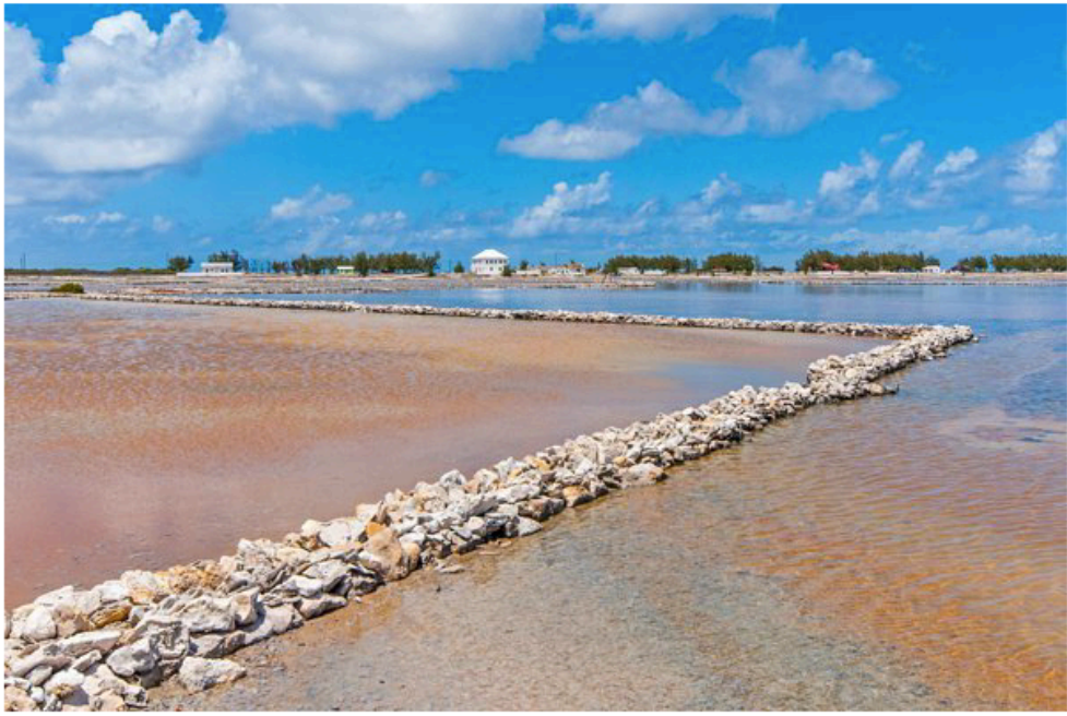
TCI TOURISM BOARD