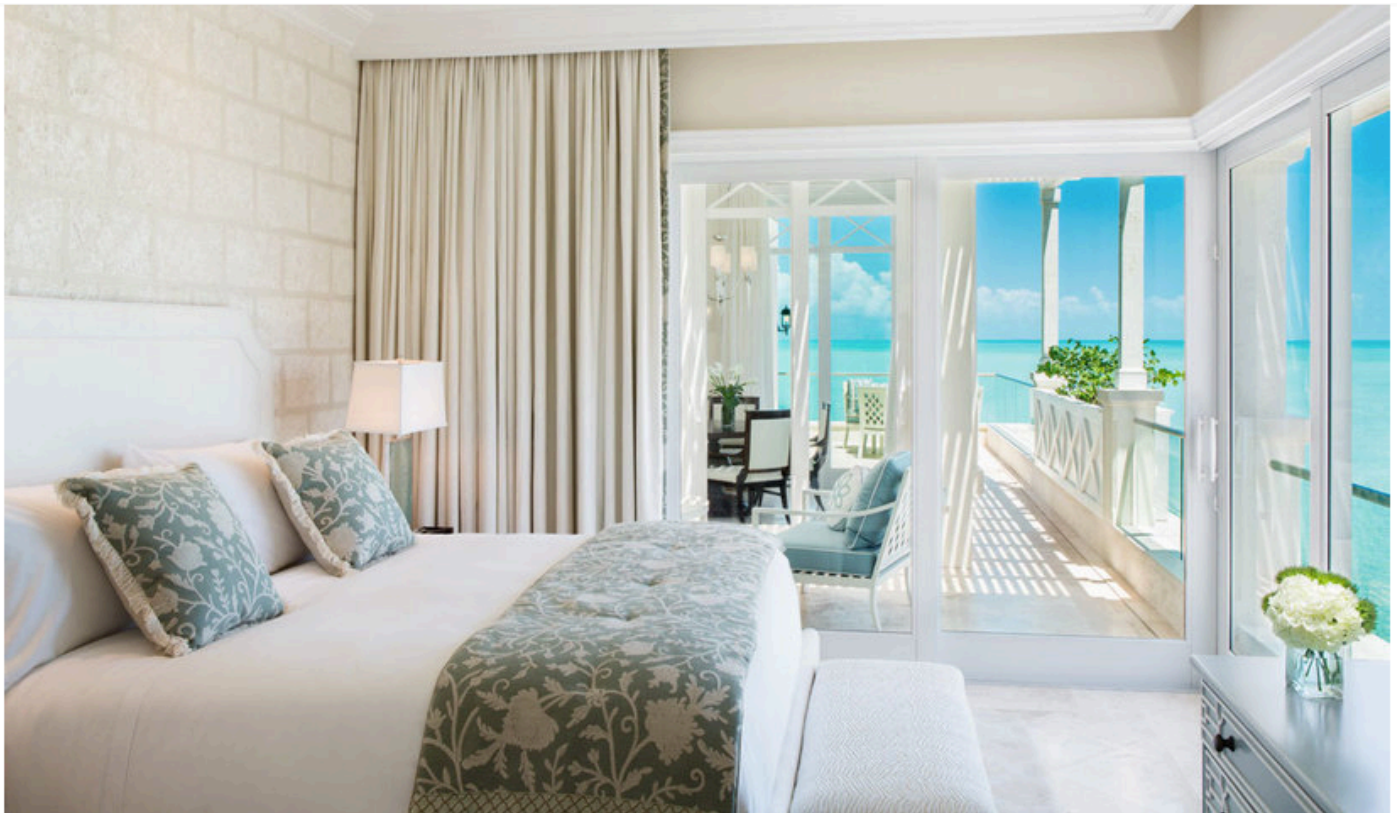
THE SHORE CLUB

4.) Humpback Whales. Annually during the winter season, humpback whales migrate from the northern Atlantic to warmer waters near the Caribbean to mate and give birth. Typically originating from the vast waters surrounding north-western Europe, Greenland, Iceland, Canada and from inside the Arctic Circle, the majority of whales head for a relatively small region near the Turks and Caicos and Dominican Republic. The whales migrate past TCI due to a deep trench near Grand Turk and Salt Cay. During winter months, take a whale watching tour or head to Salt Cay (see above), hang out at Coral Reef Bar & Grill for a front row seat to watch the migrating humpbacks.