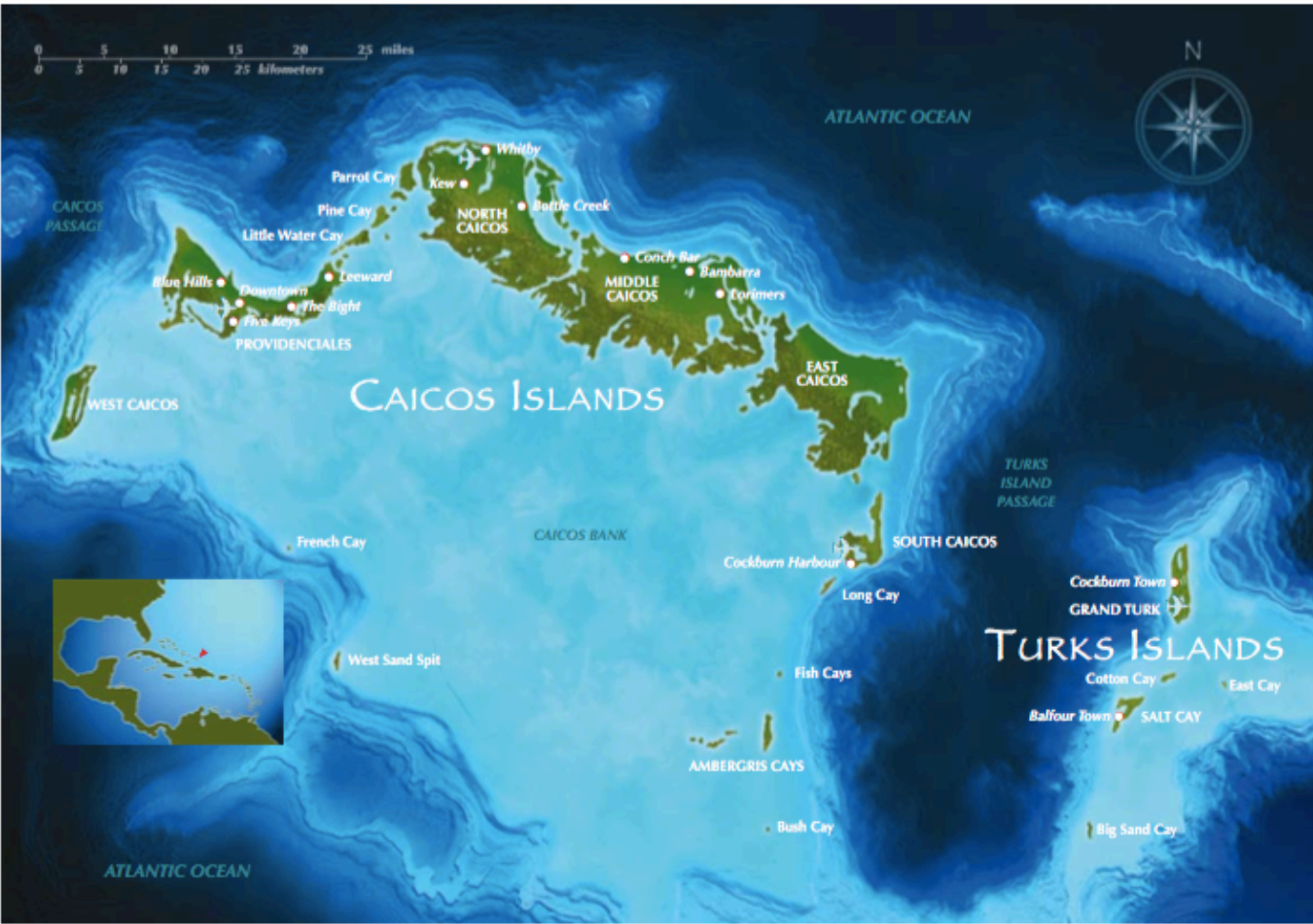
TURKS & CAICOS TOURISM Map of Turks and Caicos

1.) The water. Oh. My. Gorgeous. The water. I have been here four times and still cannot get over the gorgeous azure waters that surround Turks. They have light, soft sand and crystal clear water. Very little current also make for family-friendly beaches. The shallow water and the white limestone silt make the water a vibrant turquoise color. If you want to learn more about why the beaches are so spectacular in TCI, click here .