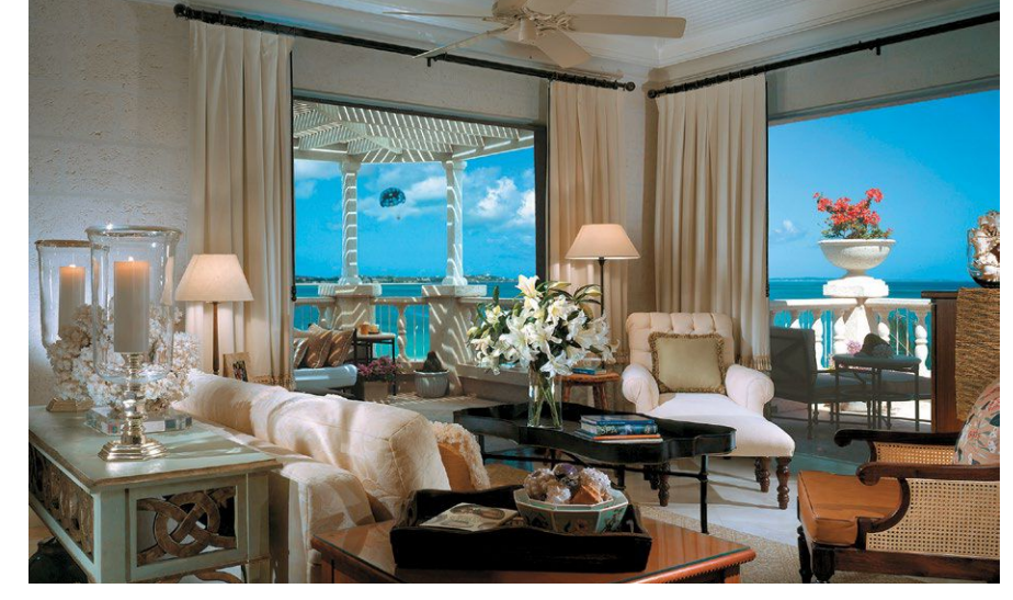
The Palms Turks and Caicos consists of 72 oceanfront suites on Grace Bay Beach. The hotel has recently unveiled some additions to its spa menu.

The Palms Turks and Caicos, a longtime Turks and Caicos luxury hotel, recently unveiled some additions to its wellness